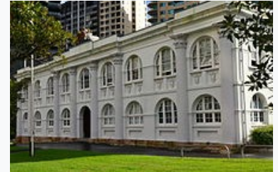
National Trust building, Sydney